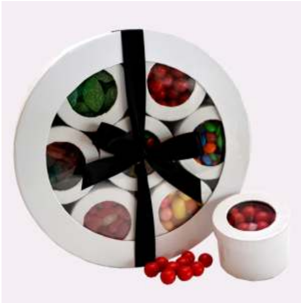
Corporate- Sweet Selection 25 cm diametre x 8cm high round tub filled with 7 individual lolly boxes of an assortment of favourite confectionery. Tied with satin ribbon $ 45.00