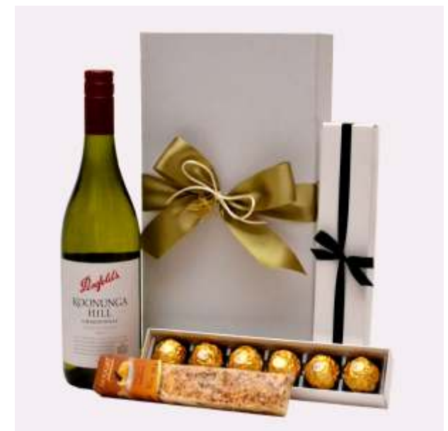
Koonunga Xmas Hill Penfolds Koonunga Chardonnay 100gm Nougat Ferrero Roche in elegant gift box Double Wine Box with Satin Ribbon $ 49.50