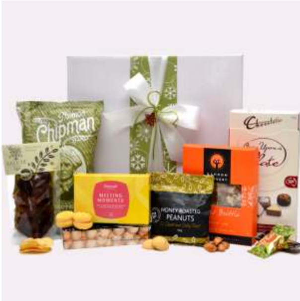
Xmas - Feeling Peckish 180gm Chocolatier Once Upon A Plate Chocolates 100gm Honey Roasted Peanuts Thomas Chipman Organic Flavoured Chips 125gm Crunchy Brittle Popcorn Nut 60gm Fiona Wall Melting Moments Chocolate Salted Caramel 50gm Black Pepper and Savoury Bites Biscuits Kalamata Olives Gift Box with Satin Ribbon $ 55.00