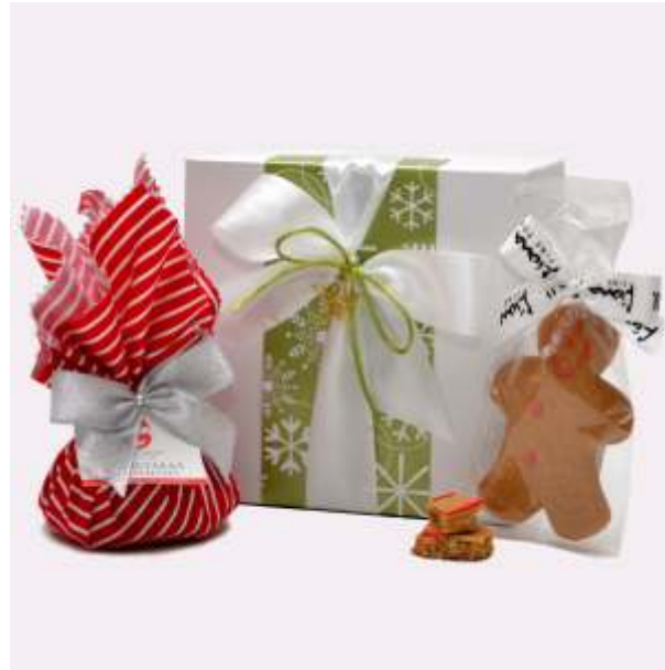
Xmas Pudding 250gm Christmas Pudding 40gm Individually Wrapped Gingerbread Man Gift Box with Satin Ribbon $ 29.95