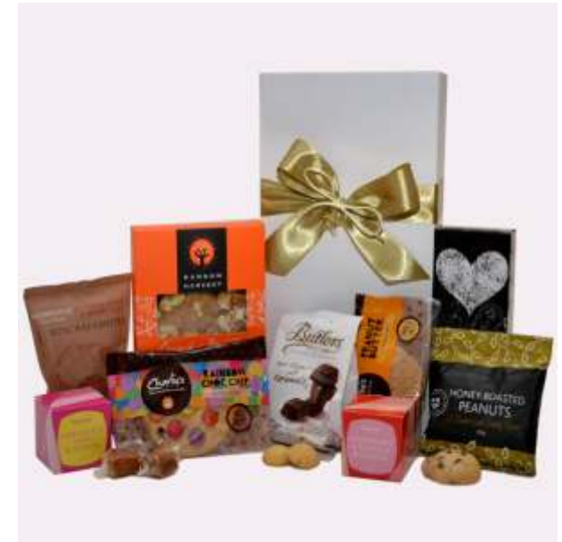
Xmas - Tempting Treats 50gm Black Pepper & Cheddar Savoury Bites 100gm Honey Roasted Peanuts 30gm Fiona Wall Choc Chip Cookies 30gm Fiona Wall Cranberry & Vanilla Cookies 80gm Charlies Rainbow Choc Chip Cookie 80gm Charlies Peanut Butter Cookie 20gm Mini Wafer Bites 125gm Crunchy Brittle Popcorn Nut 100gm Dark Chocolate Salted Caramels Gift Box with Satin Ribbon $ 43.00