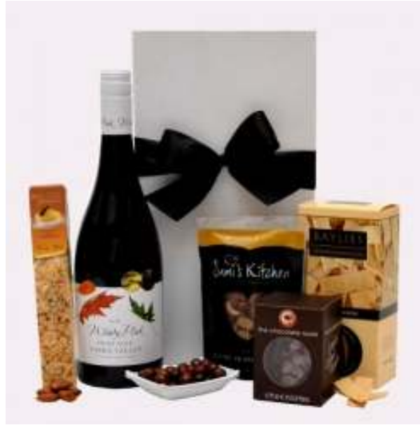
Corporate Hampers- Relax with De Bortoli De Bortoli Windy Peak Pinot Noir Wine 75gm Thyme & Sesame Nuts, Almond, Kri Kri & Cashews 100gm Nougat 120gm Dipping Crackers 100gm Chocolate Coated Fruit and Nut Mix Elegant Double Wine Box with Satin Ribbon $ 65.00