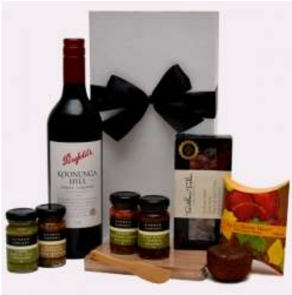
Corporate - Special Occasion Penfolds Koonunga Hill Shiraz Cabernet 100gm Fig and Walnut Desert 250gm Italian Fruit and Nut Cake Wooden Chopping Board 60gm Lemon Garlic Dill Dressing 60gm Tomato, Mango & Chilli Salsa, 60gm Sundried Tomato Mustard 60gm Fireball Chilli Mustard Wooden Spreader Gift Box with Satin Ribbon $ 88.00