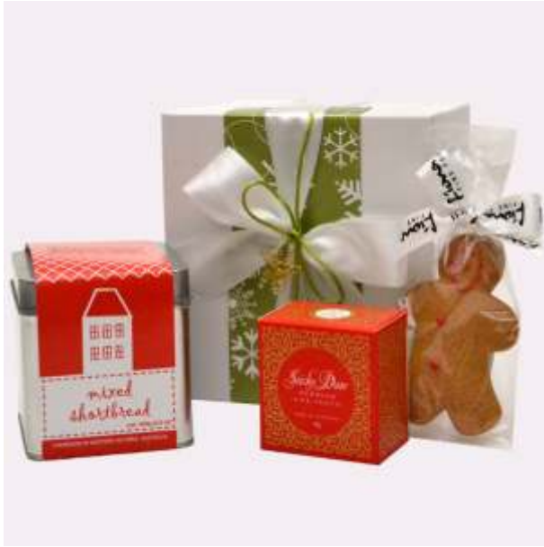
Xmas Cheer 180gm Fiona Wall Mixed Shortbread 40gm Individually Wrapped Gingerbread Man 80gm Ogilvie & Co Sticky Date Pudding Gift Box $36.00