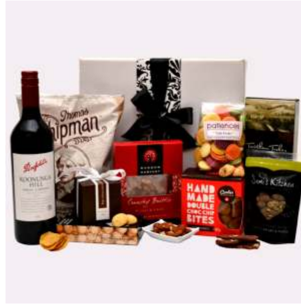
Corporate - After Work Drinks Penfolds Koonunga Hill Shiraz Cabernet Bag of Thomas Chipman Corn Chips Chocolate Coated Fruit & Nut Mix 50gm Black Pepper & Cheddar Savoury Bites 125gm Crunchy Brittle - Peanut and Chilli 125gm Hand Made Double Choc Chip Bites Thyme & Sesame Nuts (Almond, Kri Kri & Pepita) 150gm Chocolate Hazelnut Crisp Bread 150gm Cocktail "Tutti Frutti" Patience Biscuits Gift Box with Satin Ribbon $ 98.50