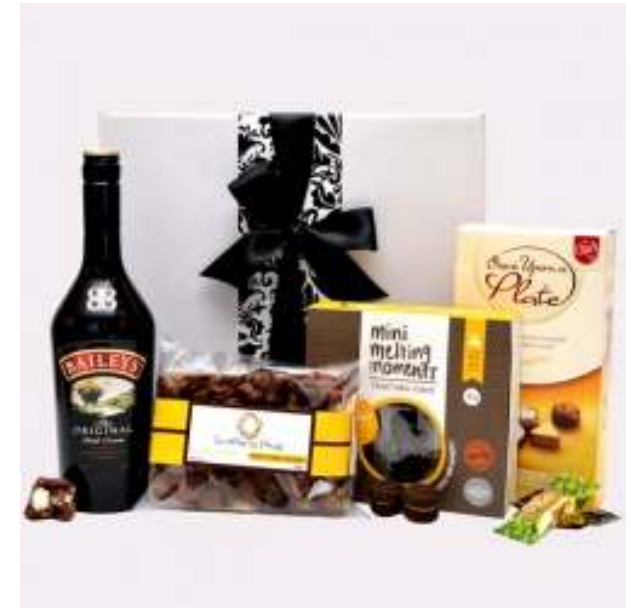
Corporate Hampers - Baileys & Chocolate 700ml Baileys Irish Cream 180gm Once Upon A Plate Chocolates 200gm Hand Made Honeycomb Caramel Rocky Road 125gm Mini Melting Moments Choc Salted Caramel Flavour Gift Box $ 89.95