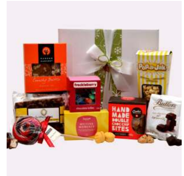
Xmas Hamper - Sweet Tooth 140gm Gourmet Popcorn 60gm Handmade Lollipop 250gm Honeycomb & Caramel Hand Made Rocky Road 125gm Crunchy Brittle Popcorn (GF) 125gm Hand Made Double Choc Chip Bites 100gm Butlers Chocolate Salted Caramels 60gm Fiona Wall Melting Moments Biscuits 250gm Freckleberry Large Gems Lollies Gift Box $ 77.50