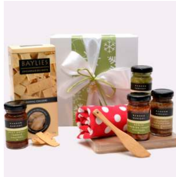
Xmas - Cheese Board Set Wooden Chopping Board 60gm Lemon Garlic Dill Dressing 60gm Tomato, Mango & Chilli Salsa, 60gm Sundried Tomato Mustard 60gm Fireball Chilli Mustard Wooden Spreader 120gm Dipping Crackers Designer Tea Towel Gift Box $ 58.50